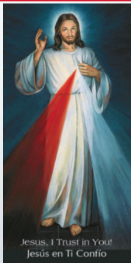
Jesus, I Trust in You! Jesús en Ti Confío