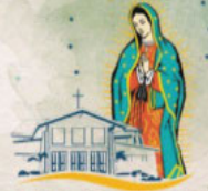
Our Lady of Guadalupe Parish