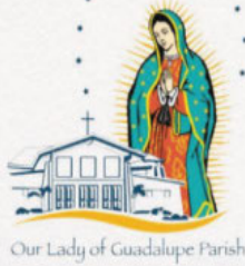
Our Lady of Guadalupe Parish